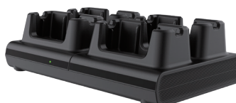
Battery Charging Base-4 slots