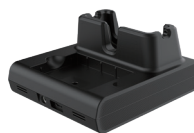
Battery Charging Base