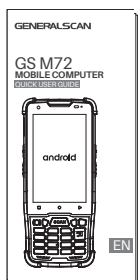
Quick User Guide