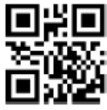
* Upper Boundary Range 40