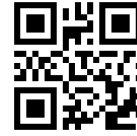
Mode 11、 10 check, transmit check bit