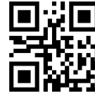
1-bit check if the data does not exceed 10 bits, 2 bits check if the data exceeds 10 bits, and transmit check bits