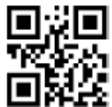
Customized Decoding Mode

The code can be output successfully only when the decode center is within the customized area.