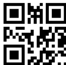
Restore Default Settings of MSI Plessey