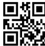
Right Boundary Range 100