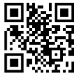
Cancel the Data String of Previous Reading