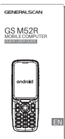
Quick User Guide