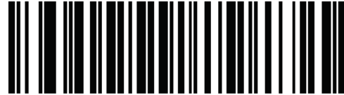
Auto Aim with Illumination

Auto Aim with Illumination - The engine turns on the aiming pattern and internal illumination LEDs when it senses motion. A trigger press activates decode processing. After two seconds of inactivity the aiming pattern and internal illumination LEDs automatically shut off.