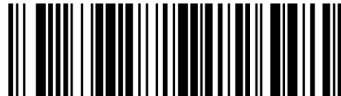
Disable Sleep Mode