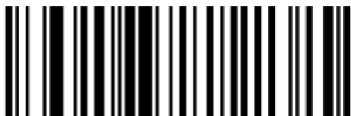
*High Volume (0)