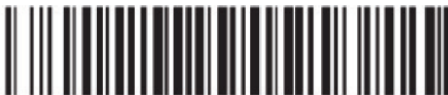
Low Speed Upload