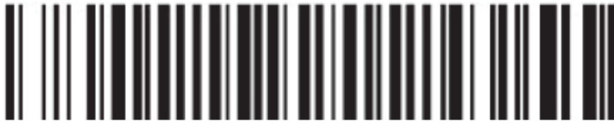
Fast Speed Upload

Step3: The barcode that allows to start the scanner. When need to transfer the information of the scanning barcode to the device, can scan anyone of the three barcodes below.