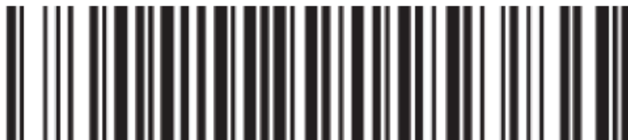
Disable Offline Storage Mode(*)

Step4: When need to quit from the offline mode, please scan the barcode below f