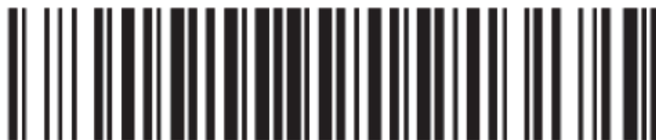
Enable Offline Storage Mode

Step2: Scan the barcode of Enable Offline Storage Mode, enter offline mode status, scan the barcode at this moment, the information of the barcode will not output to the connected device.